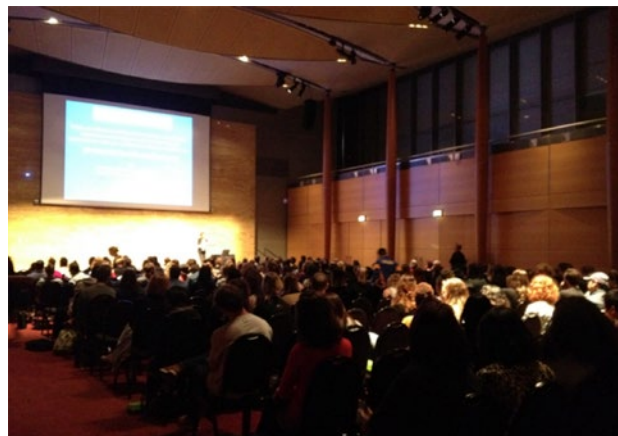
UNSW screening in May 2016

UNSW is also looking forward to participating in the forthcoming national survey of students aimed at gathering more comprehensive data about the prevalence of sexual harassment and assault and to learning from the national report on best practice recommendations.