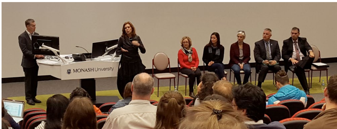
Campus screening at Monash University